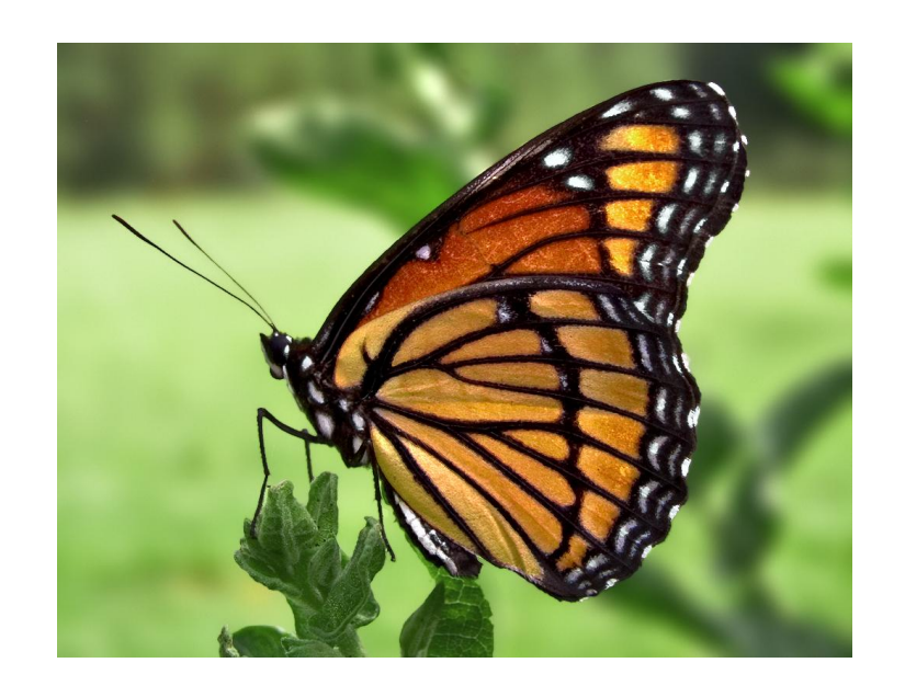
Caterpillars -> Butterflies: Leave them alone if not troublesome because Butterflies = Beneficial