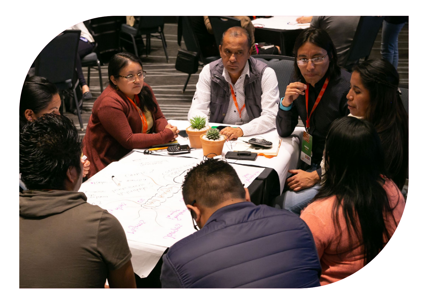
Exhibit 1 lists questions that evaluators can pose as part of the engagement process throughout the stages of evaluation. Some of these questions come from the "By Us/For Us" framework for engaging and reaching out to Indigenous communities (Bowman et al., n.d.).

Evaluators working in service of racial equity have to operationalize what it means to engage the community in a way that moves the community toward developing the power to influence decisions that affect their lives. Engaging the community in this way not only ensures more robust data collection and offers research findings that increase the validity, accuracy and trustworthiness of information, it also ensures that the knowledge generated by the evaluation is accessible and useable to the community (Bowman et al., n.d.).